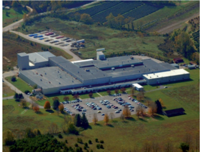
320,000 sqft plant, Marion, NC